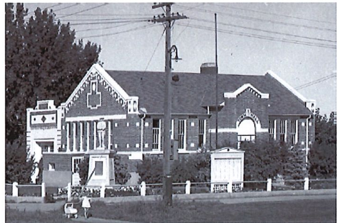
Raymond's Town Hall as it appeared in the 1930s. Note the entrance to the fire hall on the south elevation (left).

The Town Hall is further valued as a prominent historic landmark in Raymond and as a site of the military service commemoration. On the southeast corner of the site is an elegant and solemn memorial to the veterans of the First and Second World Wars. The intent for the construction of a war memorial emerged following the First World War, a time when few thought there would ever be another war like it. In 1930, the Raymond War Memorial Committee was created to oversee site selection, design, and fundraising efforts. As the Town Hall was under construction at the time, the committee submitted a proposal to Town Council for Raymond's Great War memorial to be placed on the same site. Its situation next to the Town Hall makes it a highly visible landmark in Raymond. The base was designed and poured by Raymondites, with the statue of the soldier made in Italy. The cenotaph was dedicated on July 1, 1931, and has since served as the community's site of commemoration for those who have fought and those who lost their lives during periods of conflict.