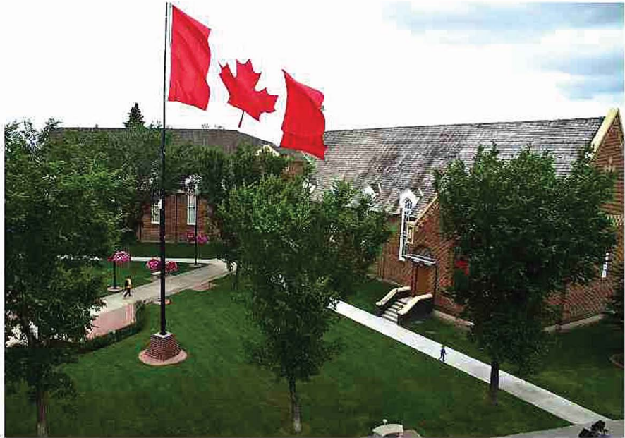
Historic Community Centre July 1st Flag