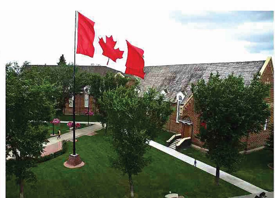
Historic Community Centre July 1st Flag